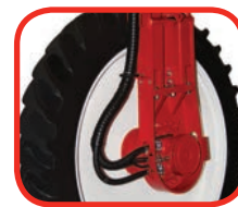
Bolted wheel motor mounts