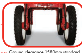
Ground clearance 1580mm standard