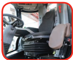
Rops cab with pneumatic main seat and passenger seat