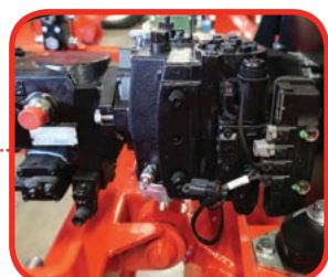
Electronically operated feed pump kit