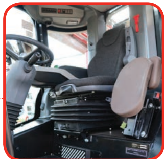
Rops cab with pneumatic main seat and passenger seat