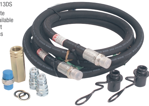
Hose Kit – BP-613DS Hose kit complete with fittings. Available in long and short drawbar versions