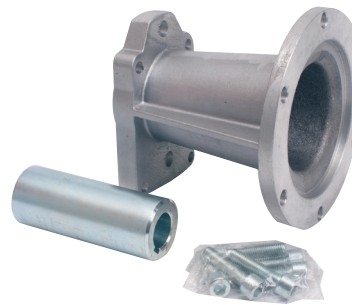
Flange and Coupler Kit AR1568 For the smaller range of AR pumps (up to AR135) or for converting an existing 6-spline model from PTO to hydraulic drive, the use of a flange is required