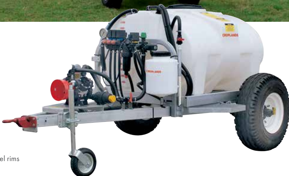
BT-1100 SHOWN WITH ELECTRIC CONTROLLER OPTION