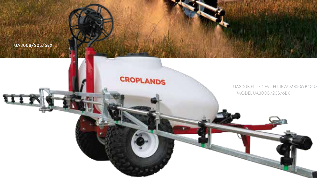
UA300B FITTED WITH NEW MBX06 BOOM - MODEL UA300B/20S/6BX