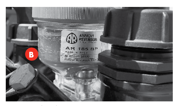
AR Pump Serial Number

The Pump Serial Number Plate is located on the pump (B) .