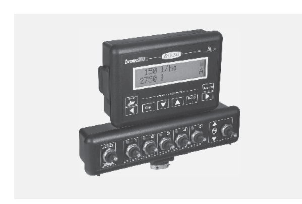
Bravo 180S Controller