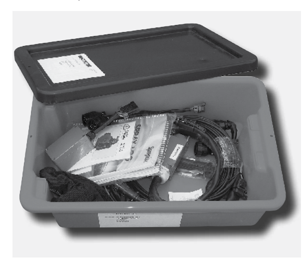
A transport box

Where applicable, all controllers, manuals, wiring looms, etc, are suuplied in a separate, sturdy, weather resistant transport box.